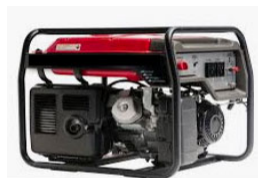
This type not allowed.