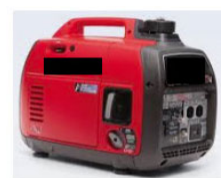
This type OK.