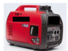
This type OK.