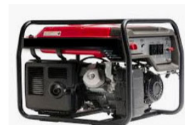
This type not allowed.