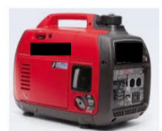
This type OK.