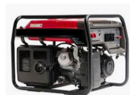
This type not allowed.